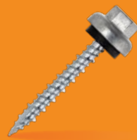
ProZ #10 Hi-Lo