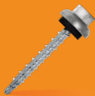
ProZ MINI-DRILL #10 Hi-Lo