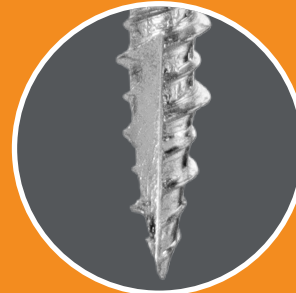
Type 17 Point