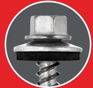
Bonded EPDM Washer