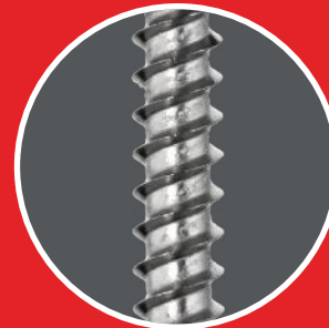
Stainless Steel Shank